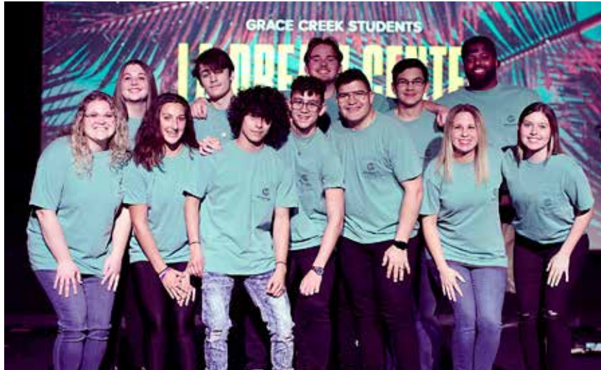
GRACE CREEK STUDENTS LA DREAM CENTER March 2022

Grace Creek Church sent a total of 38 short-term missionaries to the Los Angeles Dream Center in 2022 to support the ministry of a local church, Angelus Temple. From playing with neglected kids in under-resourced neighborhoods to handing out food and other necessities to those experiencing homelessness on Skid Row, we experienced so much ministry and life change.