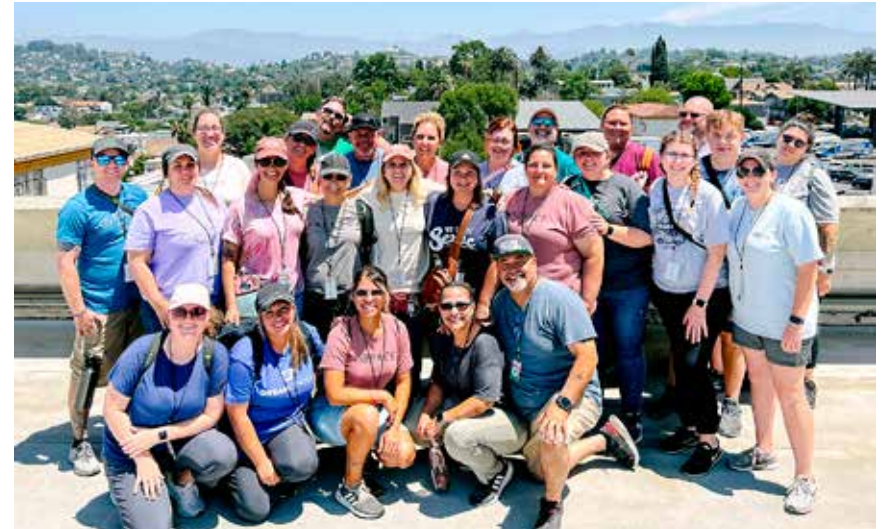
GRACE CREEK MISSIONS LA DREAM CENTER July 2022