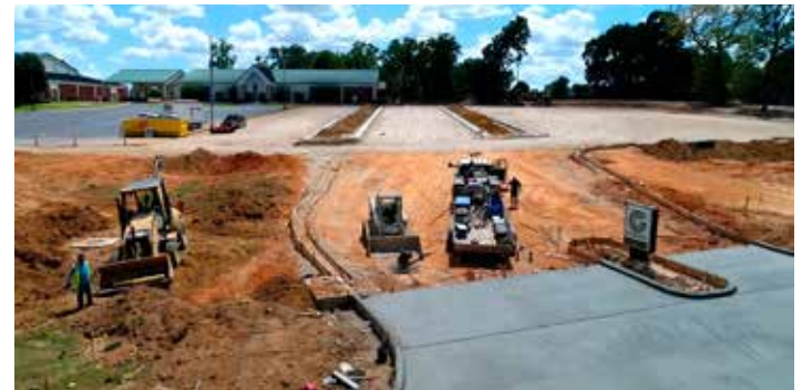
COMPLETED: SUMMER 2022